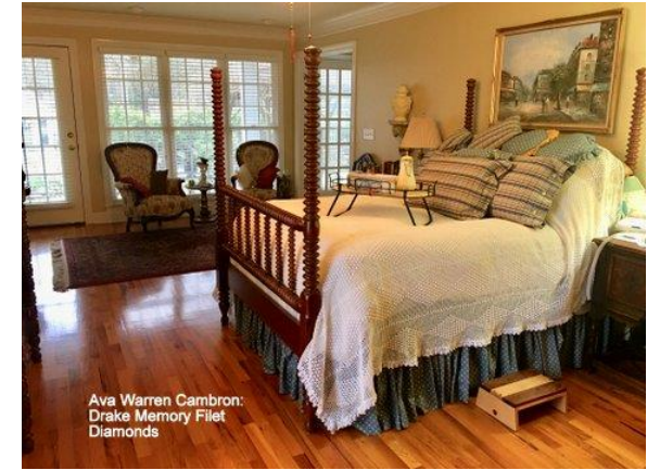
Past Alabama winner 2019 Ava Warren Cambron